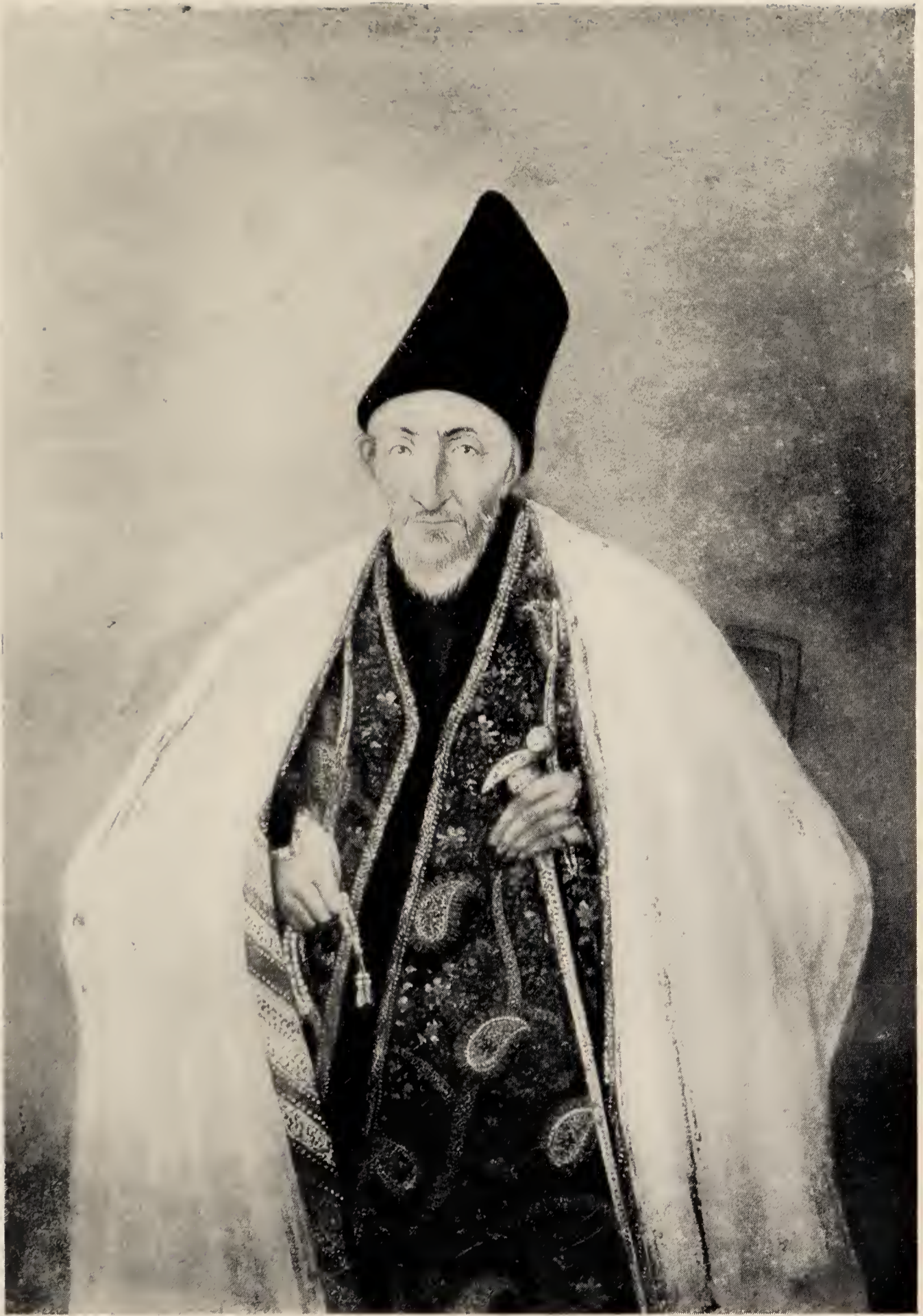
ḤÁJJI MÍRZÁ ÁQÁSÍ